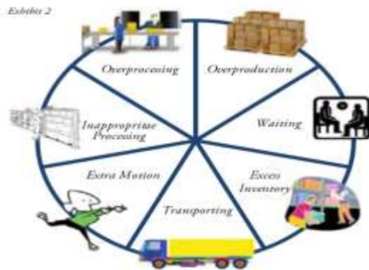
Fig. 1: Sources of Wastages in a Production System

Consuming energy, wasting people’s time and using facilities to store and move around materials and work and there’s the opportunity cost of delayed payment.