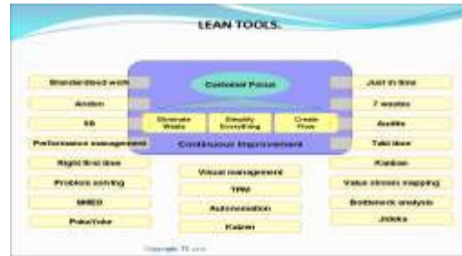
Fig. 2: Structure of VSM Based Lean Production System